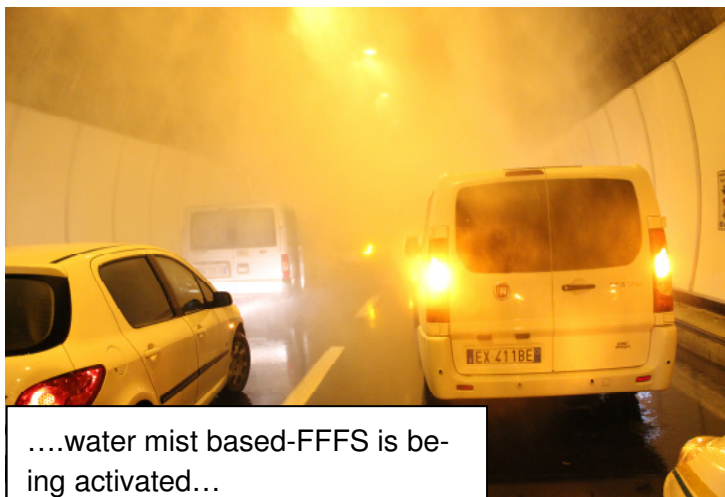
....water mist based-FFFS is being activated...

The nightmarish scenario unfolds after a van traveling in one line skids and blocks the carriageway inside the tunnel. The vehicles behind collide with the obstacle. The impact causes several injuries. The drama heightens when smoke and fire are quickly developing. As a result of the first crash another accident occurs near tunnel's entrance.