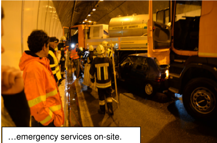
...emergency services on-site.

FOGTEC fixed firefighting system (FFFS) had been installed in 2006 as the first high pressure water mist type in a road tunnel.